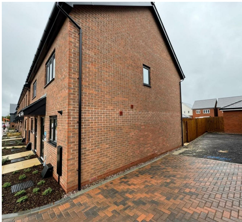
45 Banbury Drive PE7 8SD